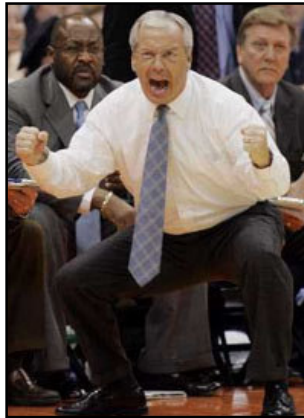
UNC and Roy Williams won the 2005 NCAA Tournament.

... so far, that is. That's right, YOUR Miami Hurricanes take on the #4 team in the country tonight, the North Carolina Tar Heels. Last week was not kind to either team, as the Canes lost to Boston College and NC State on the road, losing their #21 ranking, while North Carolina went down at home against Maryland, spoiling their undefeated season and costing them their top ranking. Both teams come into the BUC tonight looking to bounce back from those defeats, which should lead to a good game.