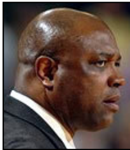
Leonard Hamilton built the UM program, but hasn't fared as well at FSU.

FSU comes into the BUC tonight off a tough overtime loss to the UNC Tar Heels. The Noles haven't done too well this year, posting a 2-6 record in the ACC, to go along with losses to the same Providence team that the Canes beat, USF, and Cleveland State. The Seminoles haven't fared well away from Tallahassee this year, but they have won three in a row in the series against the Canes.