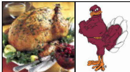
Could the Hokie Bird be your next Thanksgiving meal?

The Hokies are one of our biggest rivals; they are forever linked to us by our mutual move to the ACC in 2004, and beating them is a must. Make the arena loud, rowdy, and rockin' tonight, and help our guys pull out the win. Go Canes!