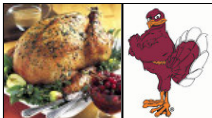
Could the Hokie Bird be your next Thanksgiving meal?

The Hokies are one of our biggest rivals; they are forever linked to us by our mutual move to the ACC in 2004, and beating them is a must. Make the arena loud, rowdy, and rockin' tonight, and help our guys pull out the win. Go Canes!