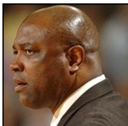
FSU Head Coach Leonard Hamilton built our program.

Florida State is always a big game, not just because of our rivalry, but also because they have our old coach. Leonard Hamilton built the Canes basketball program essentially from scratch, getting us to the Sweet 16 in 2000 before leaving to coach the Washington Wizards at the request of Michael Jordan. After being let go, he returned to the college ranks and found a home at the enemy school. He's a member of the UM Sports Hall of Fame, so treat him with respect, but remember, he's a Nole now.